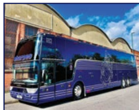
TDX21 VAN HOOL ALTANO 40 CORPORATE HOSPITALITY WHEELCHAIR ACCESSIBLE