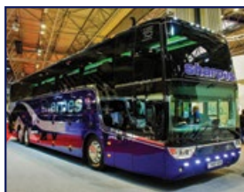
TXD21 VAN HOOL ALTANO 66 SEAT CLUB CLASS WHEELCHAIR ACCESSIBLE