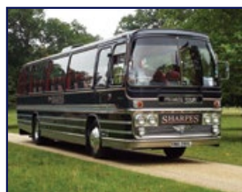
1973 AEC RELIANCE PLAXTON PANORAMA ELITE III 51 SEAT HERITAGE