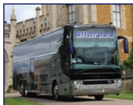
TX17 VAN HOOL ASTRON 59 SEAT EXECUTIVE