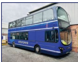
VOLVO B9TL GEMINI 2 74 SEAT BELT DDA COMPLIANT WHEELCHAIR ACCESSIBLE