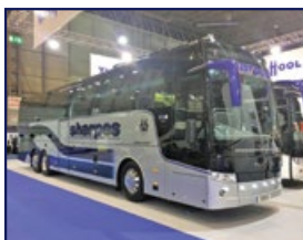
EX16H VAN HOOL 57 SEAT EXECUTIVE