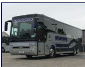
T915 VAN HOOL ALICRON 51 SEAT EXECUTIVE