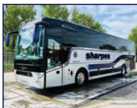
TX15 VAN HOOL ALICRON 49 SEAT EXECUTIVE