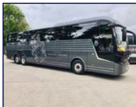
VOLVO JONCKHEERE JSV 140 36 CORPORATE HOSPITALITY