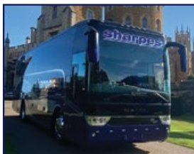
TX11 VANHOOL ALICRON 39 SEAT EXECUTIVE