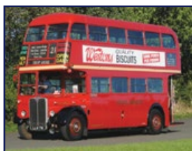
1950 AEC REGENT III RT 56 SEAT HERITAGE