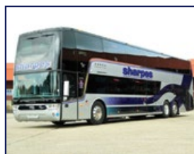
TX27 VAN HOOL ASTROMEGA 83 SEAT EXECUTIVE WHEELCHAIR ACCESSIBLE